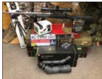
2023 DREAM OUTDOORS PACKAGE